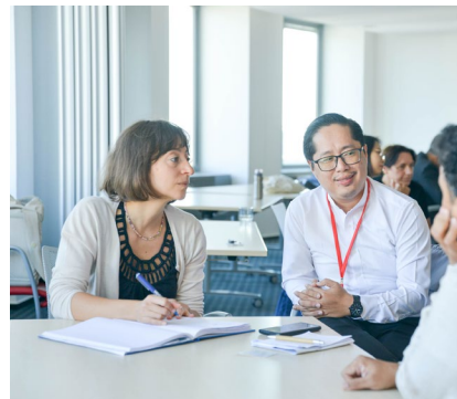
Impressions of the Global Meeting of The RBH Network 2023 in Berlin.